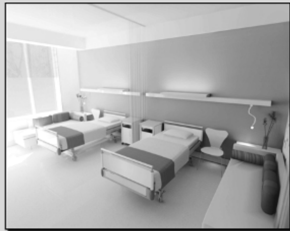
Double bed view