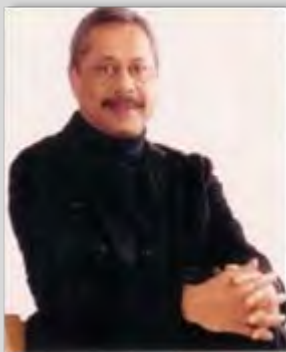
Dr Naresh Trehan

Medicity aims to functionally integrate within one campus and one management the facilities of medical care, teaching as well as research and development. It also offers to explore the possibility of integrating knowledge of traditional and alternative medicine with modern medicine, through means of scientific research.