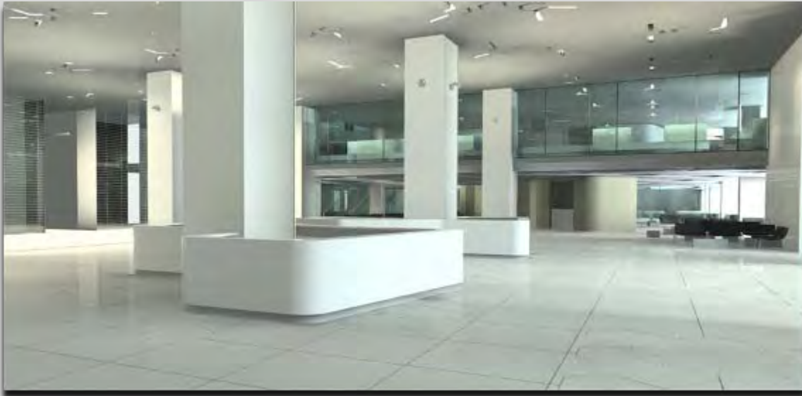
Medicity lobby view

Located across 43 acres in the new international business destination, Gurgaon, Medicity will be a 1600-bed institute of world standards with over 48 operating theatres.