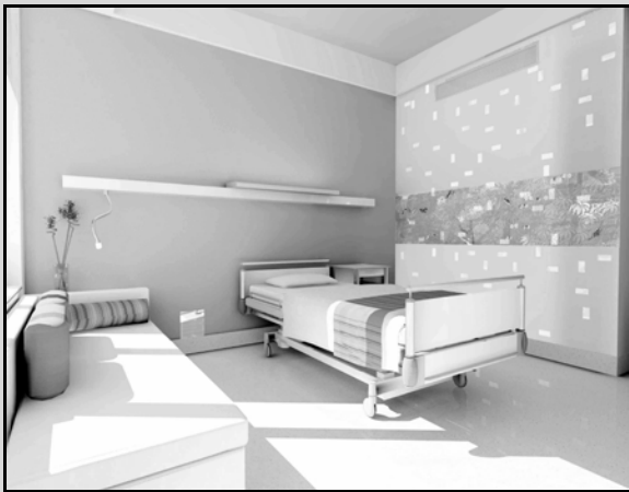
Single bed view

Located across 43 acres in the new international business destination, Gurgaon, Medicity will be a 1600-bed institute of world standards with over 48 operating theatres.